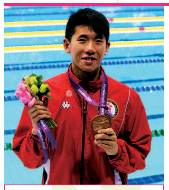
歐棨麟於倫敦2012殘奧會贏得一面銅牌,為港爭光。 Au Kai Lun won Hong Kong's first bronze medal at London 2012 Paralympic Games.